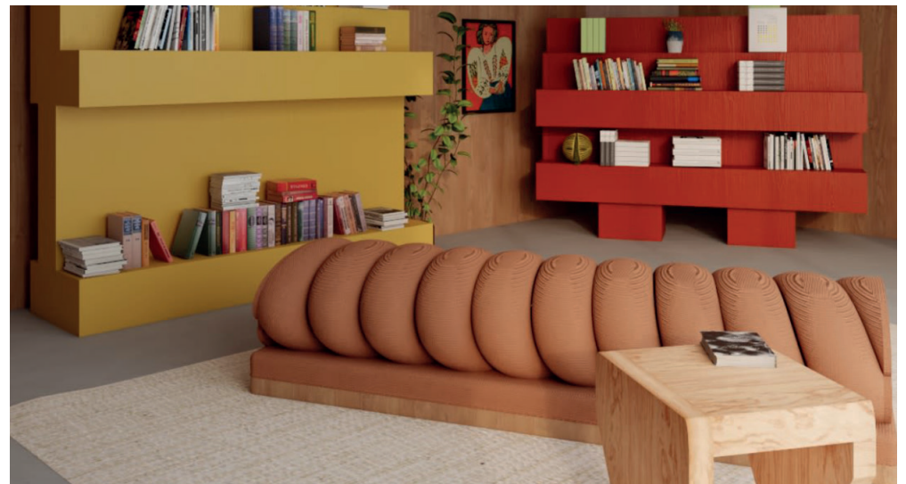
Pouf by Rejo Design