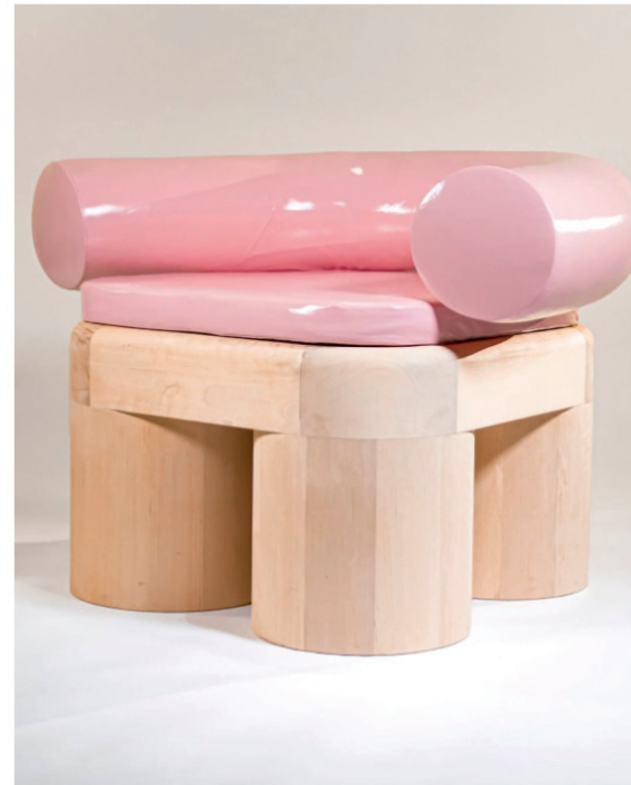
Frame Shaming Armchair by Sofie Wallenius Studios

If beauty attracts, it's the taste and comfort of an object that brings back users. Design forge links with imagination and childhood memories. If beauty and good attracts, the mind associates them with emotions, an environment, a context. An emotional approach.