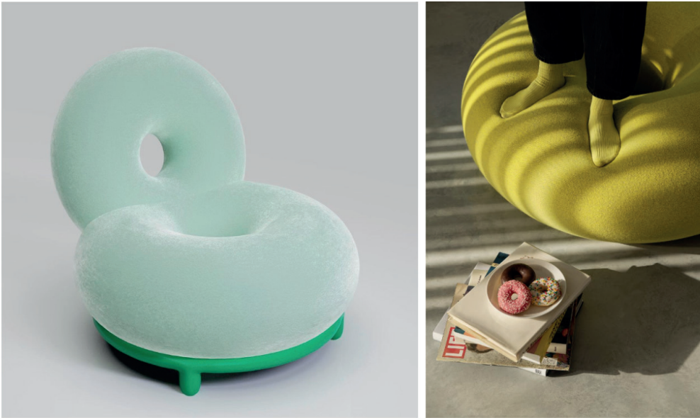
Pouf Boa by Sabine Marcelis for Hem

If beauty attracts, it's the taste and comfort of an object that brings back users. Design forge links with imagination and childhood memories. If beauty and good attracts, the mind associates them with emotions, an environment, a context. An emotional approach.