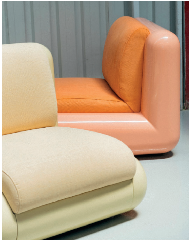
FLOAT couch by Sarah Ellison Studio and Armchair T4 by Holloway Li for Uma