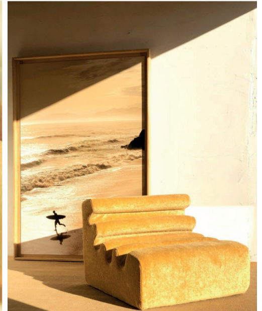
Armchair by MAISONJAUNE STUDIO