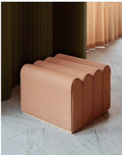
Arkad Pouf by Note Design Studio